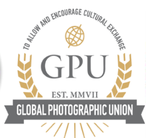
License L 190016