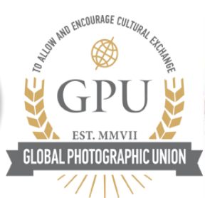
License L 190015