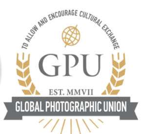
License L 200044

Malmö International Photo Society cordially invites photographers from all over the world, amateurs as well as professionals, to participate in